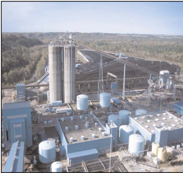
Alabama Power's James H. Miller facility

The 2010 Engineering and Operations Conference, held Oct. 27-29 was a great success. The conference offered insightful discussions of pole attachments and flame retardant uniforms and a tour of Alabama Power's James H. Miller facility, located on the Black Warrior River near West Jefferson, Ala.