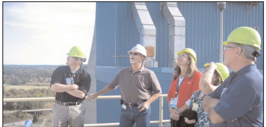
ECA members enjoy a tour of the Alabama Power Miller Facility