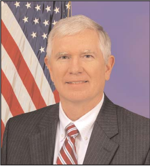
Congressman Mo Brooks (AL-R, 5th)

Electric Cities of Alabama will feature a monthly spotlight on Alabama's Congressional Delegation to help its members learn more about the Alabama Congressional Members and their views on legislation. This month's spotlight is Congressman Mo Brooks.