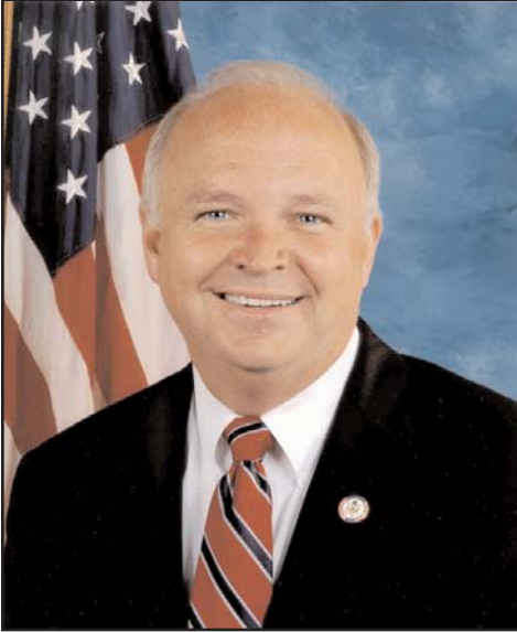
Congressman Jo Bonner (AL-R, 1st)

Electric Cities of Alabama will feature a monthly spotlight on Alabama's Congressional Delegation to help its members learn more about the Alabama Congressional Members and their views on legislation. This month's spotlight is Congressman Jo Bonner.