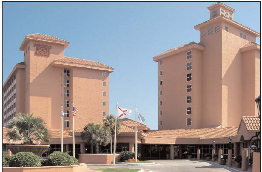
Book Your Room at the Perdido Beach Resort and Become a Perdido Beachian!