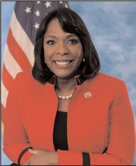
Congresswoman Terri Sewell (AL-D, 7th)

Electric Cities of Alabama will feature a monthly spotlight on Alabama's Congressional Delegation to help its members learn more about the Alabama Congressional Members and their views on legislation. This month's spotlight is Congresswoman Terri Sewell.