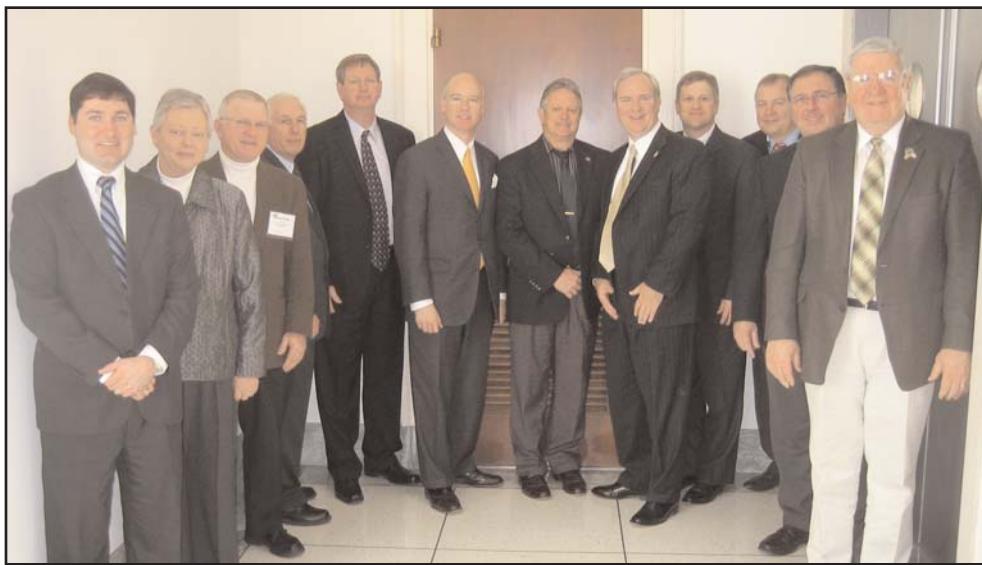
ECA members with US Congressman Robert Aderholt (AL-R, 4th) in Washington, D.C.