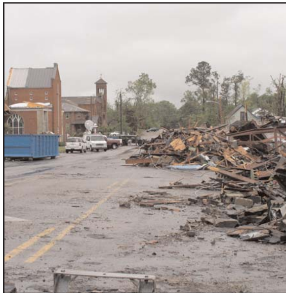
Tornado destruction in the City of Cullman