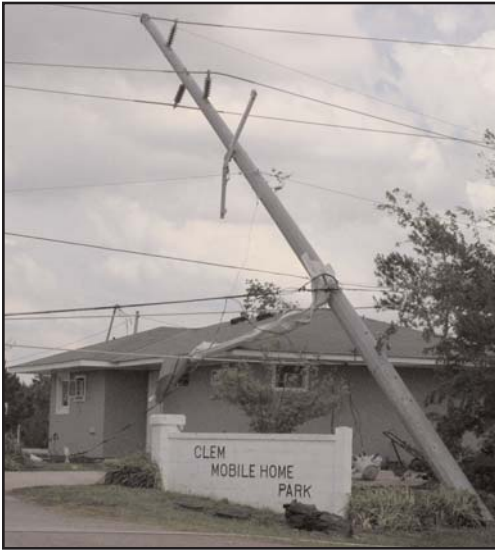
Power lines destroyed in the City of Athens

ECA members partnered together last month to restore power to several member utilities across north Alabama that were affected by the April 27 tornado crisis. ECA commends the cities of Albertville, Andalusia, Decatur, Dothan, Fairhope, Foley, Fort Payne, Hartselle, Muscle Shoals, Opelika, Russellville, Scottsboro, Sheffield, Troy, Tuscumbia and Tuskegee for responding to a call for assistance from fellow electric cities members in north Alabama. The violent tornadoes and thunderstorms tore through several counties across the state leaving at least one million Alabama homes and businesses without electricity.