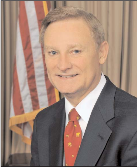
Congressman Spencer Bachus (AL-R, 6th)

Electric Cities of Alabama will feature a monthly spotlight on Alabama's Congressional Delegation to help its members learn more about the Alabama Congressional Members and their views on legislation. This month's spotlight is Congressman Spencer Bachus.