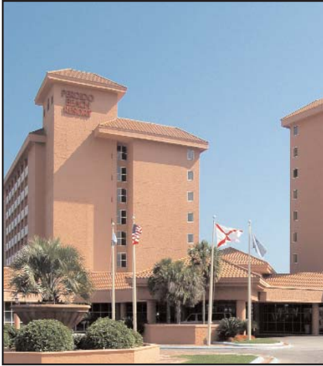
ECA's 11th Annual Meeting and Governmental Affairs Conference July 10-12, 2011, Orange Beach, AL

ECA's 11th Annual Meeting and Governmental Affairs Conference is right around the corner, have you registered yet? This annual meeting allows ECA member cities, along with key staff and elected officials, to gather and exchange ideas and experiences. To register with ECA, log on to our website www.electriccities.org and complete the registration form available under the Upcoming Events section of the homepage. The deadline to register with ECA is June 10.