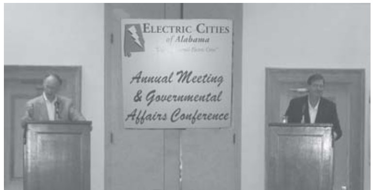
Dr. Robert Bentley & Commissioner Ron Sparks

The 2010 Electric Cities of Alabama’s (ECA) Annual Meeting and Governmental Affairs Conference was a tremendous success due to strong member support and an electric lineup of speakers. From a sand sculpting contest on the beach, to a Gubernatorial Forum with Dr. Robert Bentley and Commissioner Ron Sparks, there was something for everyone to enjoy during this years conference.