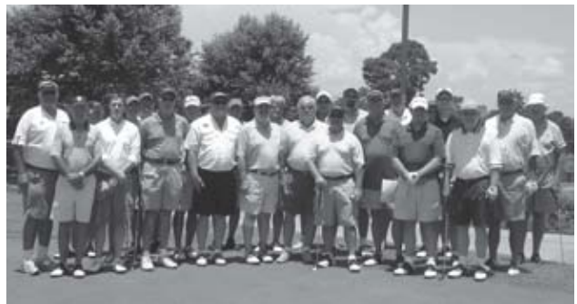
Golf outing at ECA's 2010 Annual Conference

This meeting will convene immediately following the adjournment of the E&O Conference.